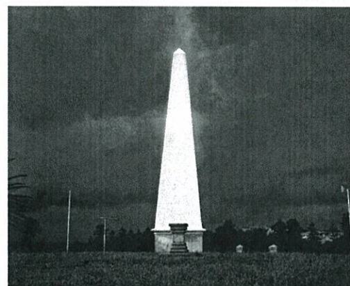
The Obelisk, Newcastle, 2008